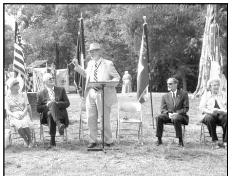
Musgrove Mill speakers