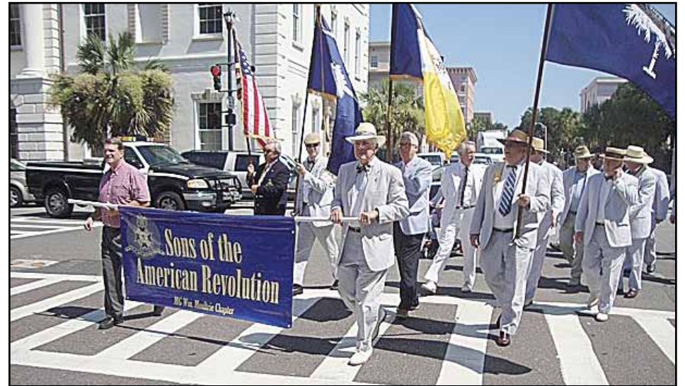
Compatriots of several SCSSAR chapters and state officers march down Meeting Street during Carolina Day festivities June 28.

Members who want to continue to receive the hardcopy edition do not need to do anything. Past issues of The Palmetto Patriot are available on the SC Society website www.scssar.org .