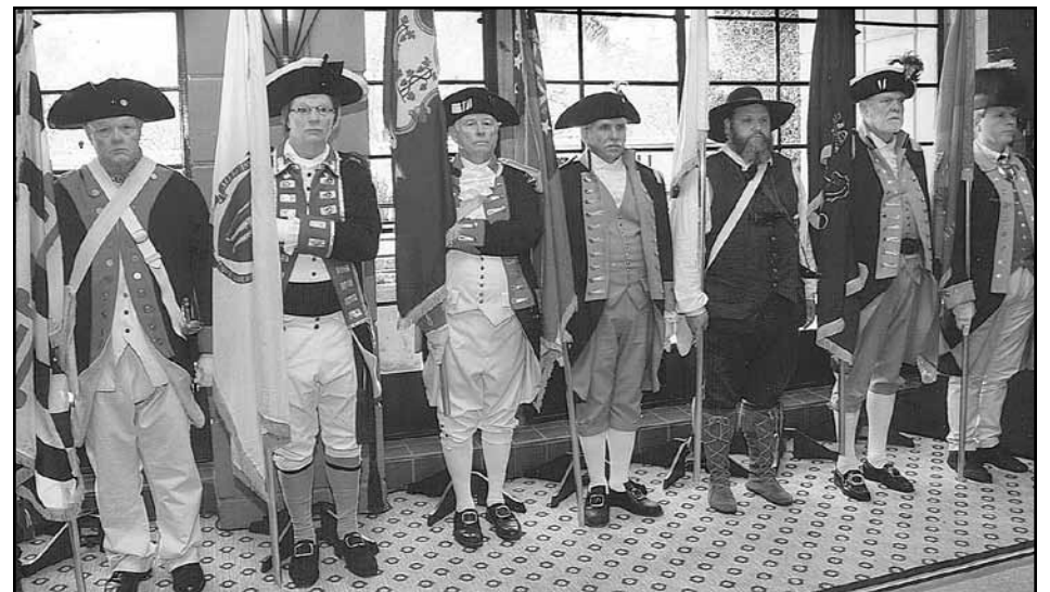
Memorial Ceremony Color Guard