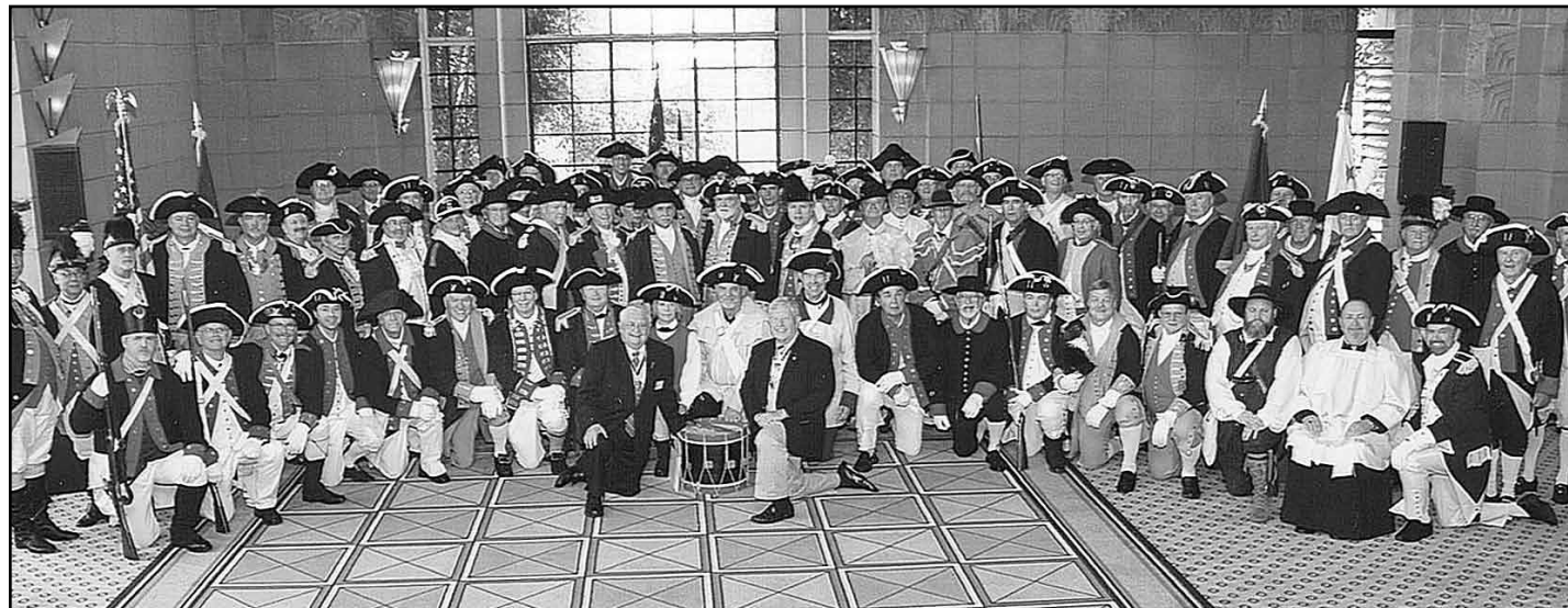
2012 National Congress Color Guard