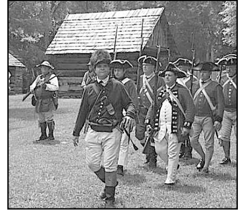
Approach of Christian Huck and troops

vengeance. Tory losses were high. Tarleton later reported that only 24 men escaped. Patriot losses were one killed and one wounded. The five prisoners were also released from the corncrib unharmed.