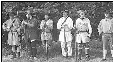
Musgrove Mill militia