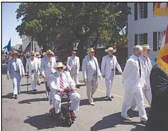
Compatriots on Meeting Street

into Fort Sullivan's which fell upon the magazine there, but did no inconsiderable damage; at the same time the Bristol of 50 guns, the Ex-