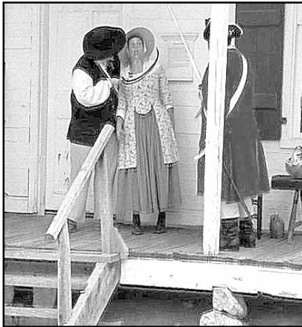
Martha Bratton threatened by one of Huck's soldiers

A week later, Huck and his men invaded the New Acquisition District York County, South Carolina, and destroyed the ironworks of William Hill, another influential Whig.