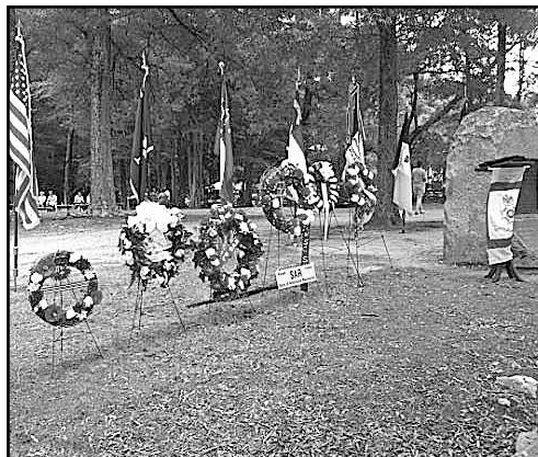
Historical Society wreaths