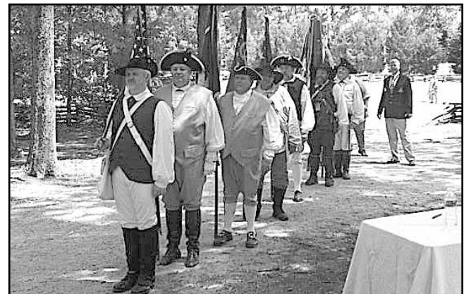
Color Guard